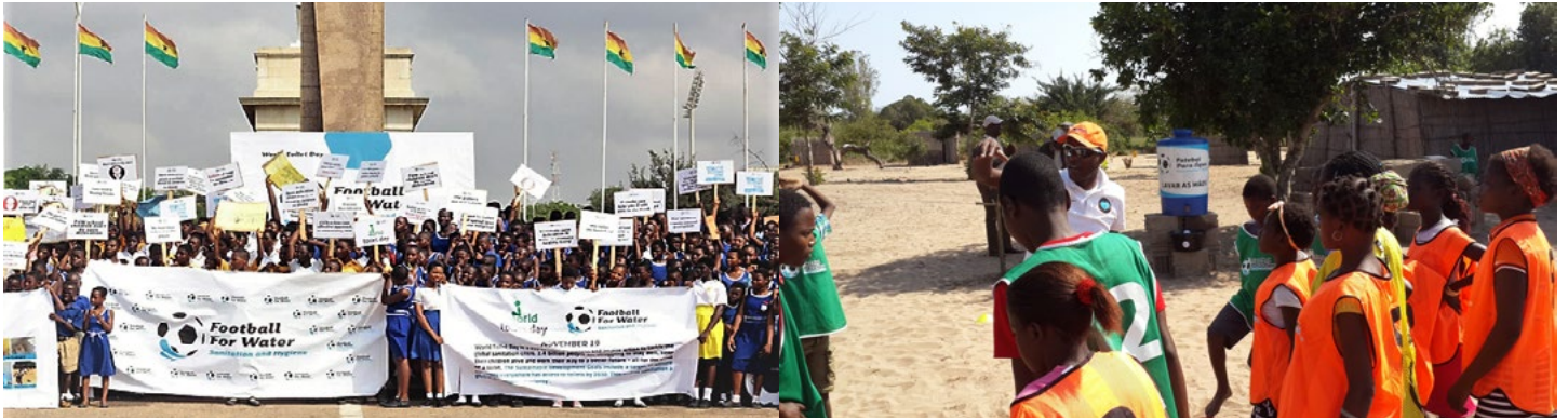
World Toilet Day events organized by Football for Water Ghana and Mozambique